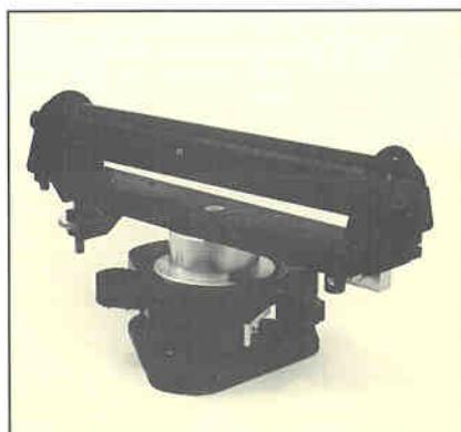
2020/1 Fine X-Y with 2030/9/1 Tribraich & Adaptor