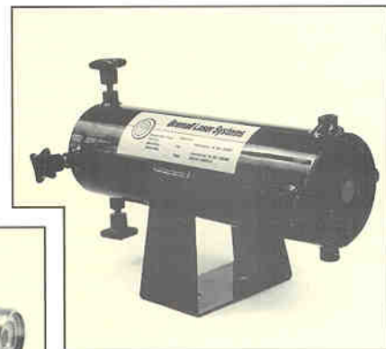
2020/10 X-Y mount