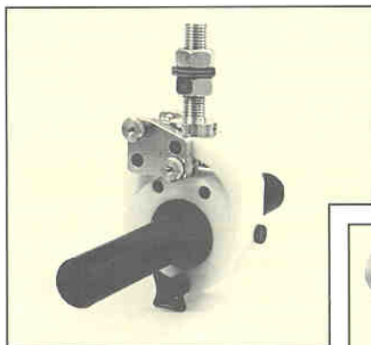
2020/22 X-Y Mount