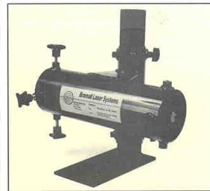
2020/9 Plinth c/w, 2020/5 tube mount

For More Details of mounting systems please contact your local dealer