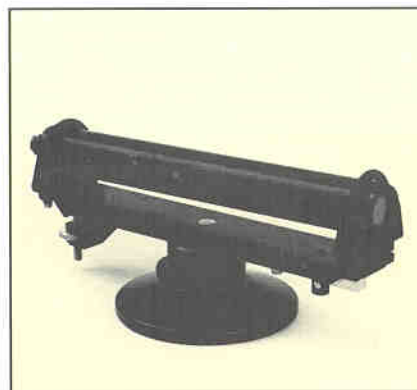
2020/1 Fine X-Y with 2030/21 Fixing Plate